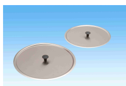
Dust covers 419 with white plastic knobs

Possibility of realization in AISI 316. Contact our sales office for details and prices.