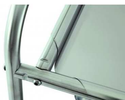
Detail of manually extractable shelves