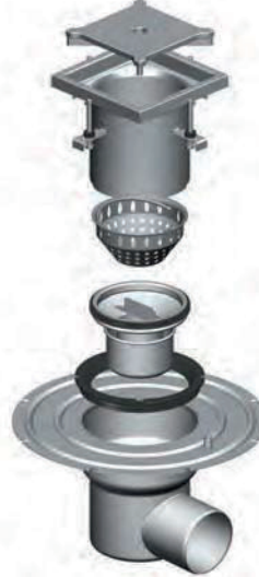
Exploded view drawing