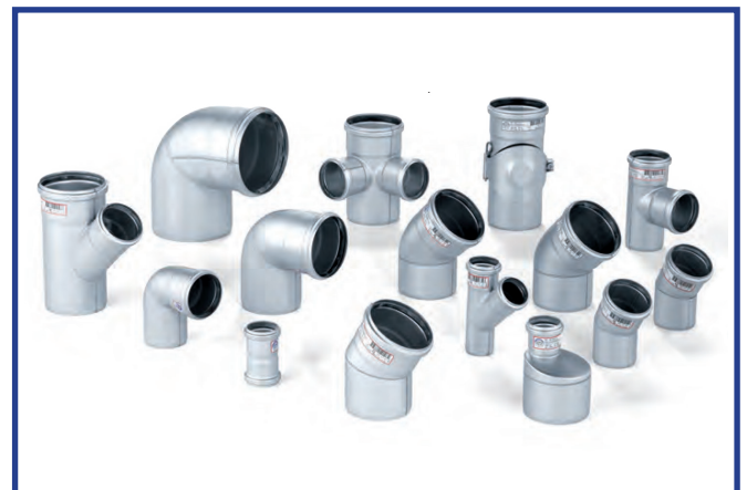
Pipes and fittings in stainless steel