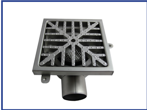
Complete drain well