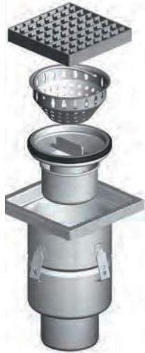
Exploded view drawing