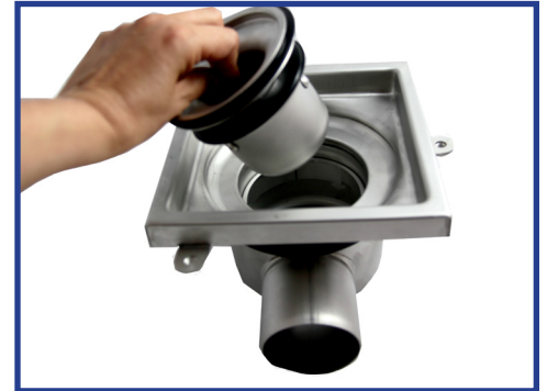
Internal siphon removal