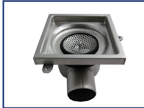
Removable internal filter